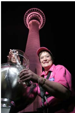
Sky Tower, Auckland, New Zealand 2005

awareness and vital funds for breast cancer research worldwide.