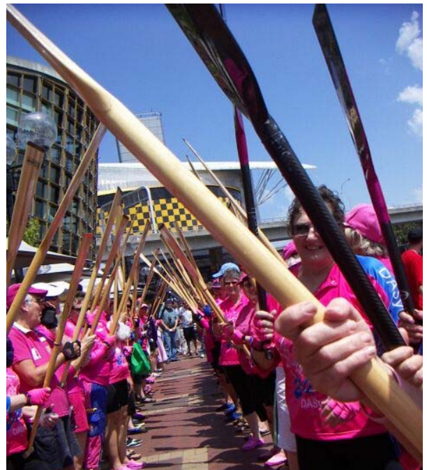
Salute and Guard of Honour, Darling Harbour