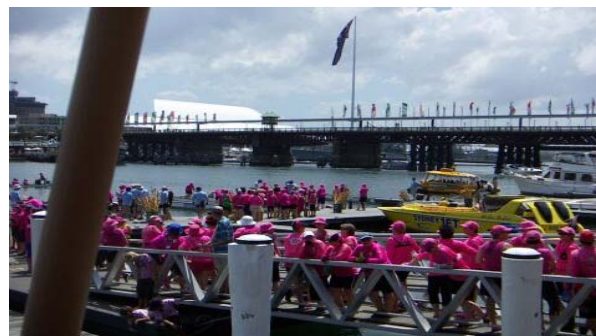
Chinese New Year 2006, Darling Harbour, Sydney

DRAGONS ABREAST – keeping the spirit alive!