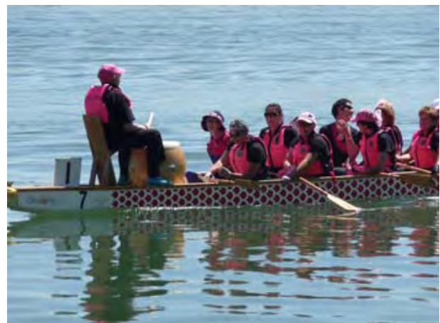
Encore ACT/ Dragons Abreast BraveHearts Albury/Wodonga, DA ACT Regatta BCNA Mini Field of Women, 24 October 2009

This is a fantastic event and a 'must', especially for new survivor paddlers who will experience the hundreds of pink ladies as they gather together with DAA teams from around the country and take part in the moving Flowers on the Water ceremony.