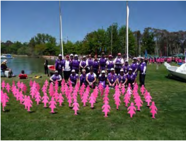
Peninsula DragonFlies, Victoria, DA ACT Regatta BCNA Mini Field of Women, 24 October 2009