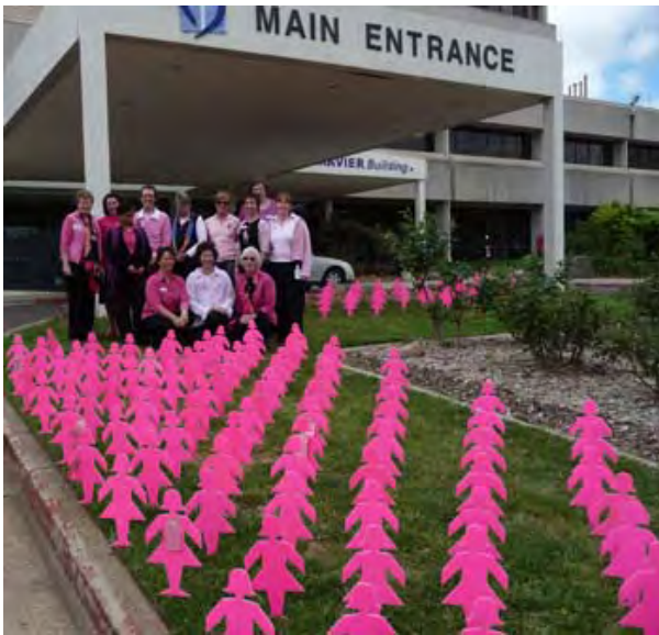
BCNs and BCNA, Calvary Healthcare, 26 October 2009