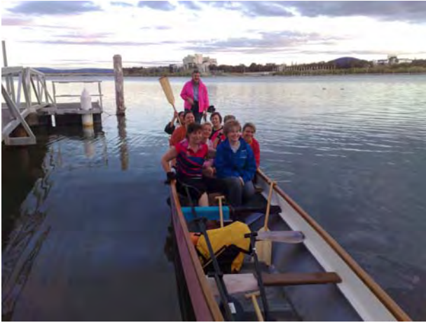
DA ACT paddled to the Light the Night Leukaemia Foundation, Floriade, September 2009