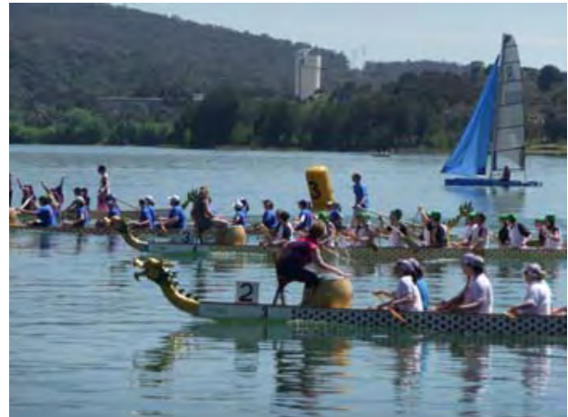
DA ACT Regatta BCNA Mini Field of Women, 24 October 2009

Follow this link to read the Dragons Abreast Australia national November 2009 enewsletter . Go to our website www.dragonsabreast.com.au .