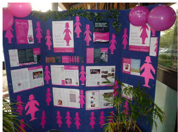
BCNA display at Erindale library during October 2009