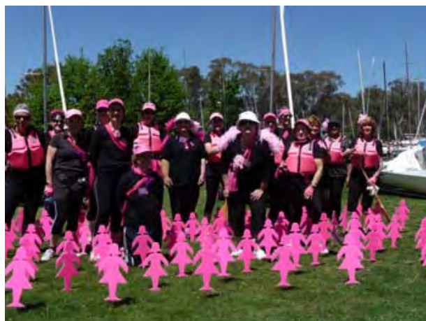
Encore ACT/ Dragons Abreast BraveHearts Albury/Wodonga, DA ACT Regatta BCNA Mini Field of Women, 24 October 2009

Dragons Abreast BraveHearts Albury/Wodonga