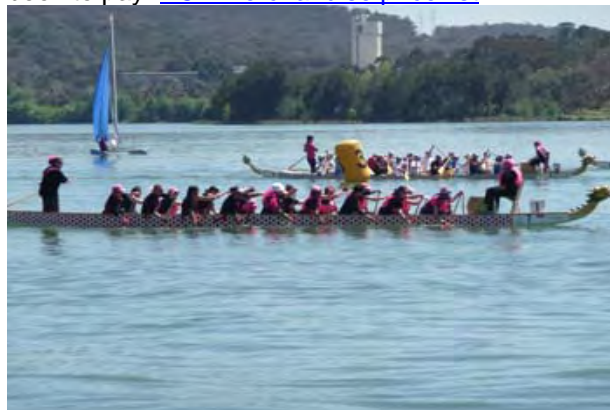
DA ACT Regatta BCNA Mini Field of Women, 24 October 2009