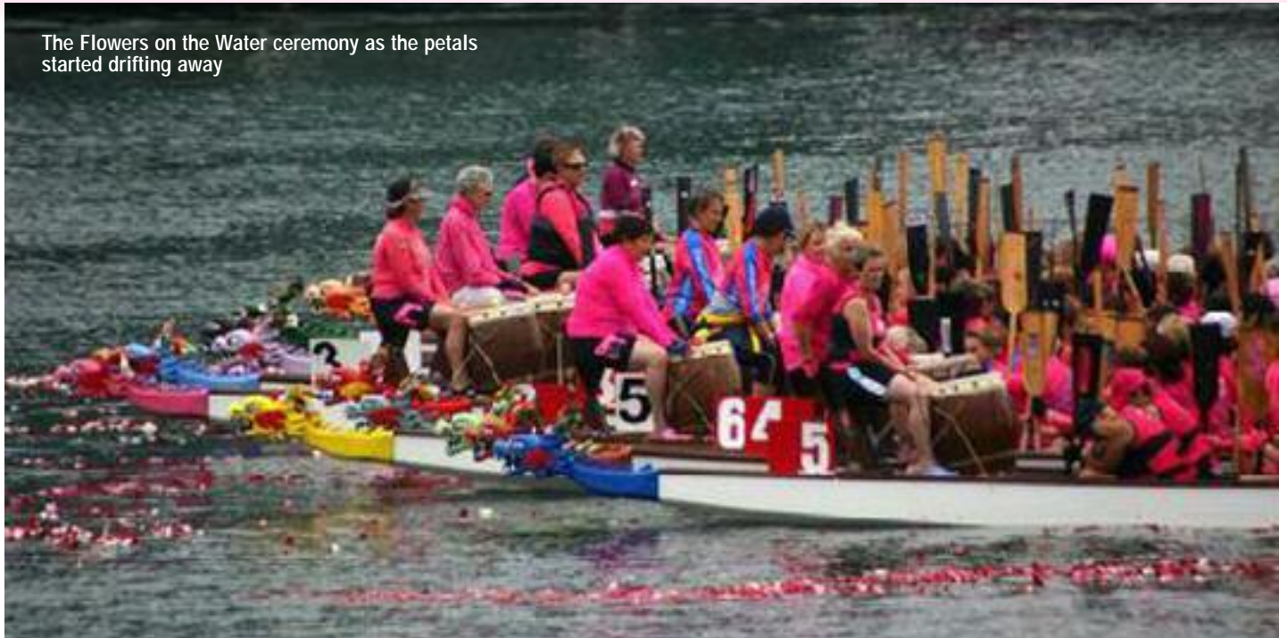
The Flowers on the Water ceremony as the petals started drifting away

dling with me as well, “I hope we will be good enough to paddle at the next Darling Harbour races!”