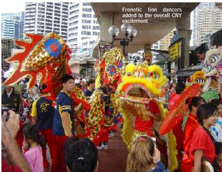
Frenetic lion dancers added to the overall CNY excitement