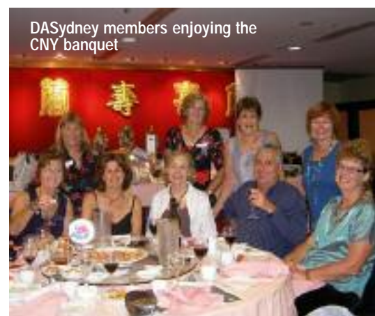
DASydney members enjoying the CNY banquet