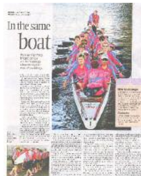
In the Same Boat – SMH 22-2-07

Naturally enough there was nary a glimpse of dragon boating in that display (it's never been televised, has it?), but the other attendees could hardly ignore the fact that dragon boating had barged into their hallowed territory – and that was probably what we enjoyed most of all!