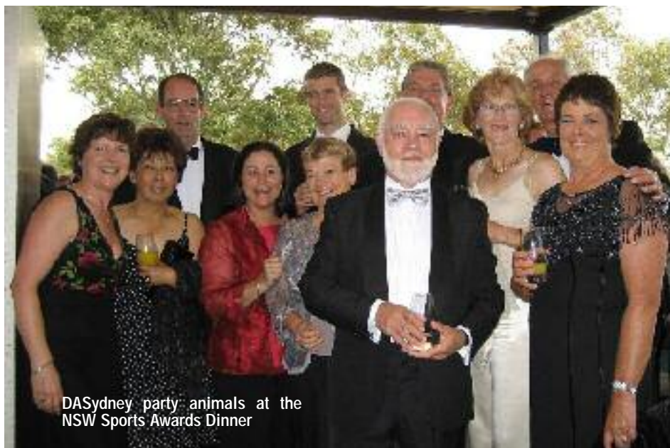
DASydney party animals at the NSW Sports Awards Dinner