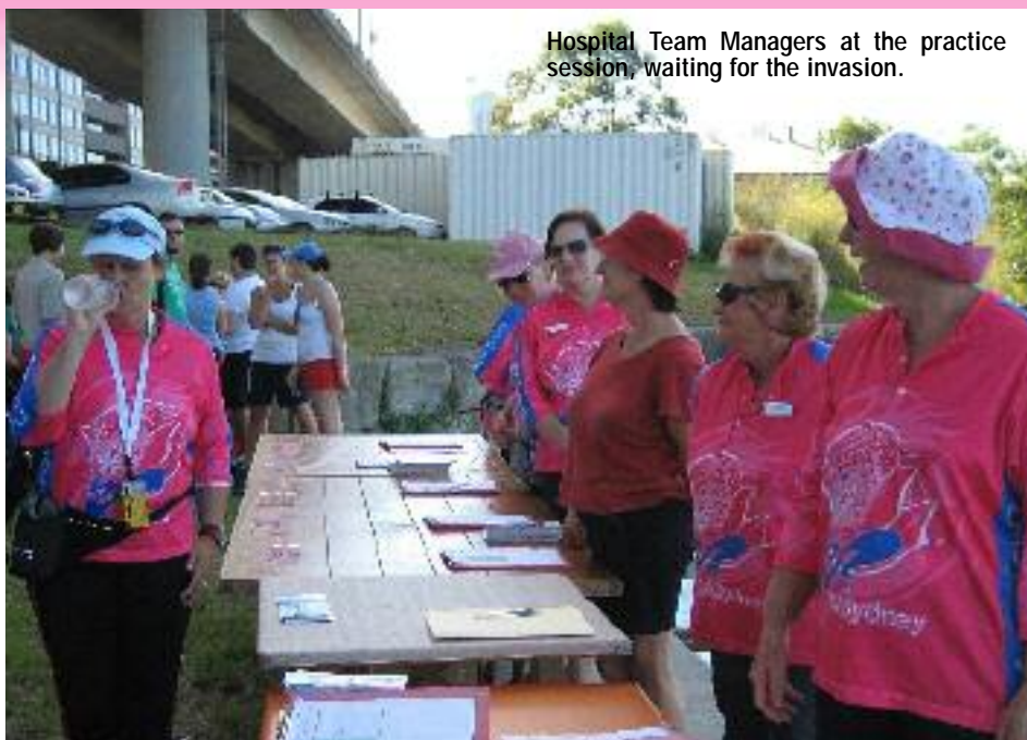
Hospital Team Managers at the practice session, waiting for the invasion.