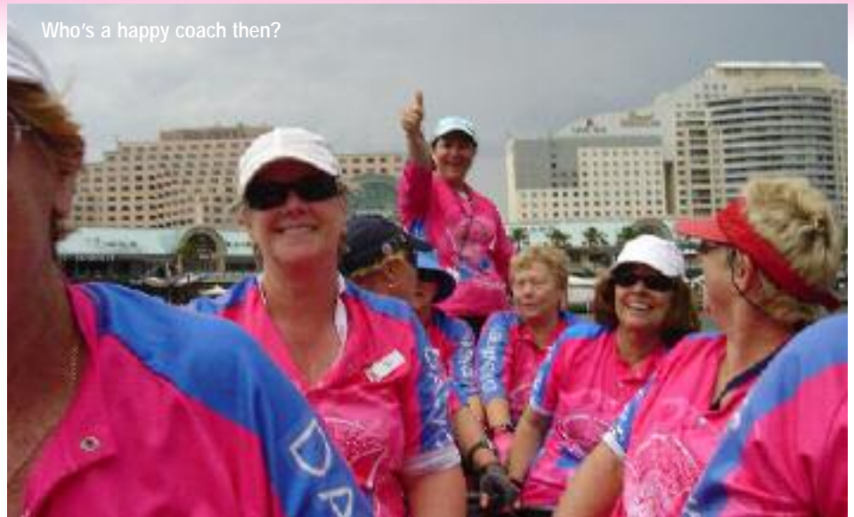
Who’s a happy coach then?

Using that word “AWESOME” again, and on a personal note, my daughter has a survivor working for her who belongs to a NSW club,