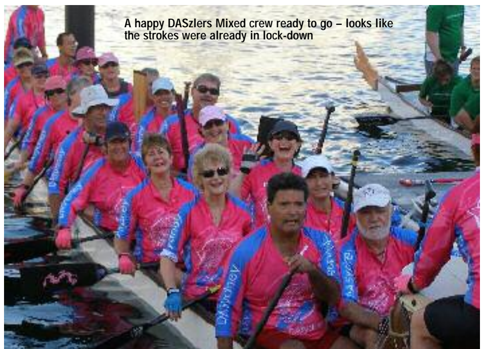
A happy DASzlers Mixed crew ready to go – looks like the strokes were already in lock-down