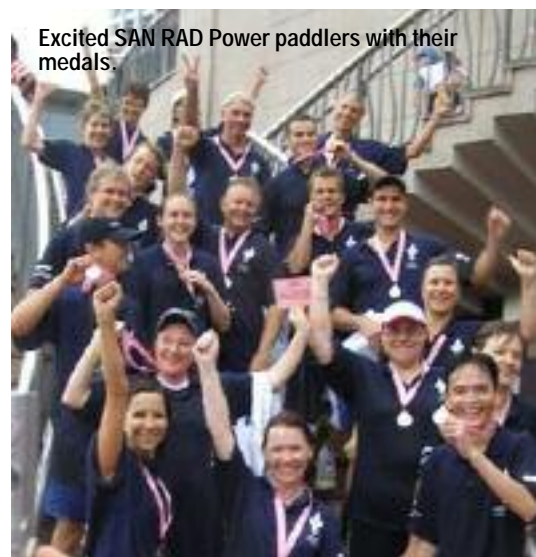
Excited SAN RAD Power paddlers with their medals.