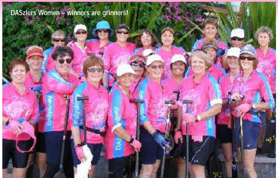
DASzlers Women – winners are grinners!

Our Masters Womens team was amazing, as not only did they win their heat with the time of 1.08.81, which was one second away from the 2nd boat, but also in the final they raced ahead winning with an improved time of 1.08.29 and this was two seconds away from the next boat!!! Every single paddler worked themselves 100% physically and mentally to ensure we were the CHAMPIONS! We know how good it feels and we don't want to change a thing!!