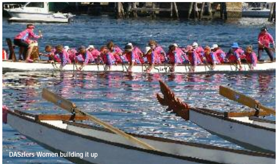
DASzlers Women building it up