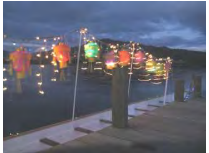
The Vietnamese lanterns and Xmas Lights area beautiful combination

The racing against Derwent Storms has been spirited with Stormy sports crew taking out two races against the Pinks Ladies' one. But it's the fun of decorating the boats with lanterns and twinkling Christmas lights that has