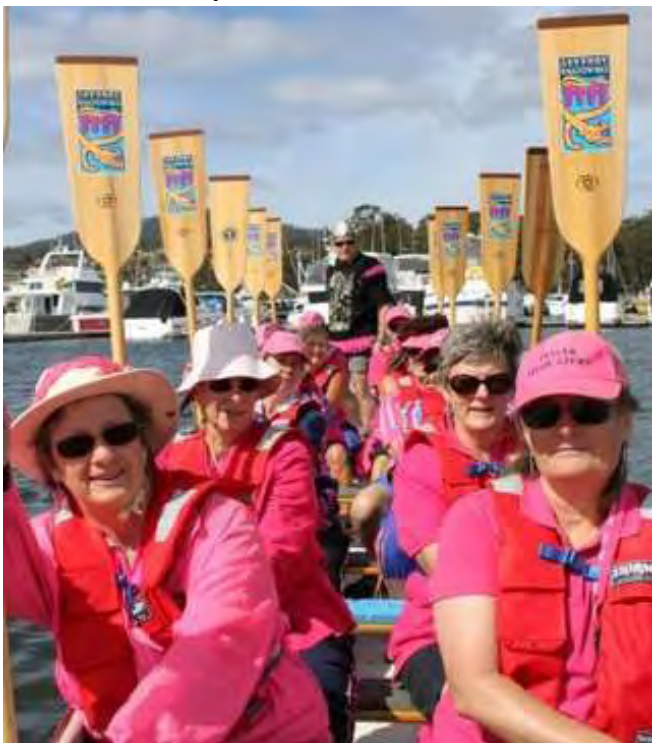
The Dragons Abreast salute on Georges Bay, St Helens