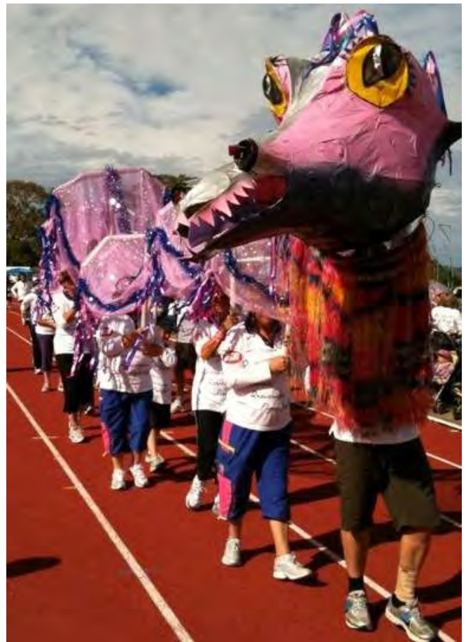
As always the DATH Dragon received great applause at the Relay for Life

A big "Thank You" is extended to all participants. It was wonderful to have so many at this special event. We would really like to thank the many "walkers" who represented us so well especially those of you who trudged through the wee small hours despite sore feet, aching legs and weary bodies. Many thanks also to the crew who helped to set up our site and pack up at the end. The crowd loved our dragon which really sparkled and entertained the crowd. Our final tally was $5,427.90. This was a fantastic effort helped by a couple of major fundraising events.