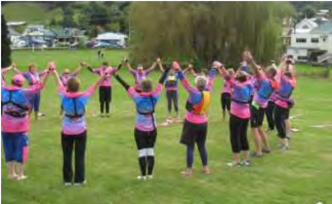
Stretches to start and there is plenty of room to swing those arms on the riverbank at Franklin

It's a familiar picture particularly in winter, except this time it's early autumn. The boat is shimmering like a Christmas tree and the paddlers are literally glowing with fluorescence for the annual Focus on Franklin regatta evening boat parade.