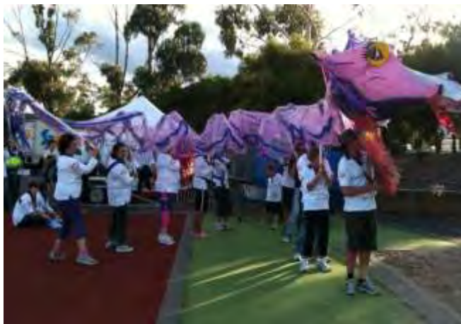
The Dragon completes its circuit of the Domain track