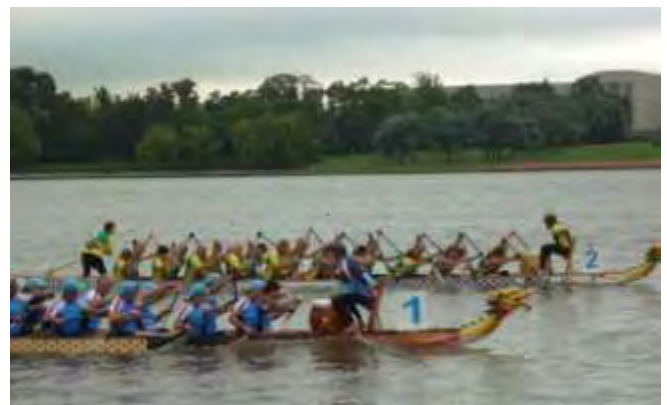
The Tassie Grand Mixed Masters ..... In the mad dash for the finishing line in the interstate competition